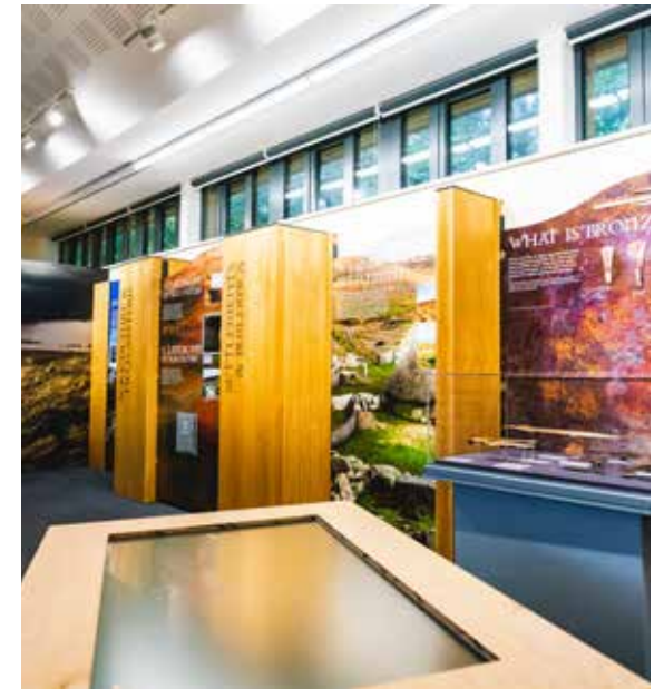
POSTBRIDGE VISITOR CENTRE INTERIOR

Incredibly, the modernisation project only needed an extra six weeks to complete despite work being significantly impacted by measures limiting the spread of the pandemic.