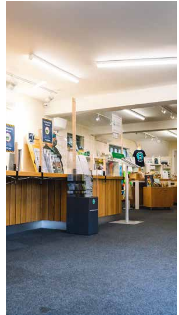
POSTBRIDGE VISITOR CENTRE INTERIOR