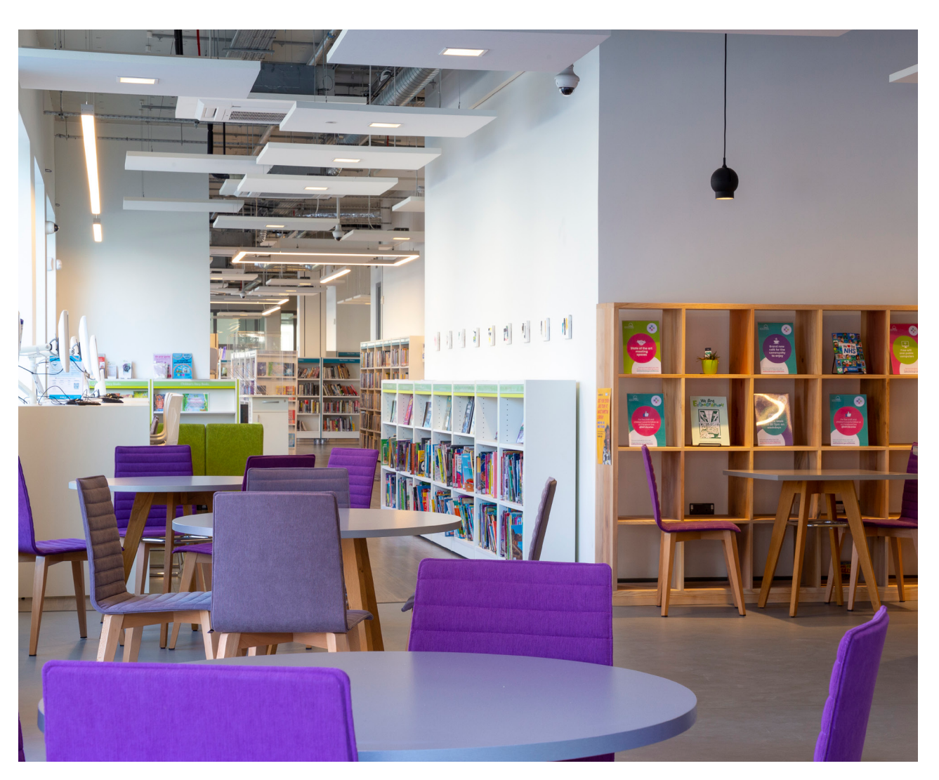
WOOD STREET LIBRARY

In the SPACES Annual Awards 2022, Wood Street Library received the Highly Commended accolade for the Small Project award.